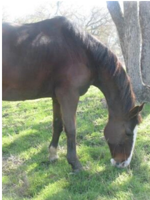
'Refreshing Pause' in 2006.

Although I first heard about this founder case in December 2001, I was not able to help until February of 2002. I ended up adopting 'Refreshing Pause' (a.k.a. 'RP') eight months later and she stayed with us for almost 4 years until she was euthanized in August 2006 at the age of 23. RP had foundered in early Spring 2001 after foaling, due to retained placenta. She had raced till the age of three and was retired as a broodmare due to a racetrack injury (she broke her left leg at the track).