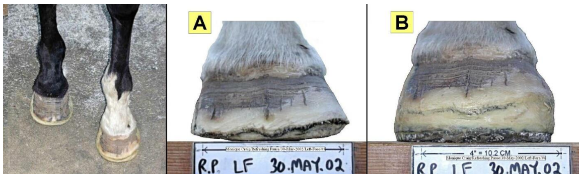
Figure 3: Glue-on shoe in May of 2002. It seemed the only way to deal with her hoof at that time. Image 'A' shows hoof before glue-on shoe applied (shown in 'B'). It was also a challenge to provide proper support to the digit without putting excessive pressure at the sole. It was also a challenge to apply the shoe and glue without tipping the hoof capsule to the medial or lateral side.

The first couple of shoeings did not significantly improve the health of the hooves but RP was comfortable enough to be brought back to her pasture. Beginning in May 2002, things started to look up. I was actually pleasantly surprised by the outcome. Her right hoof looked quite decent and despite the shape of her left hoof she was actually capable of standing on it without shoe and without drugs (fig.3)