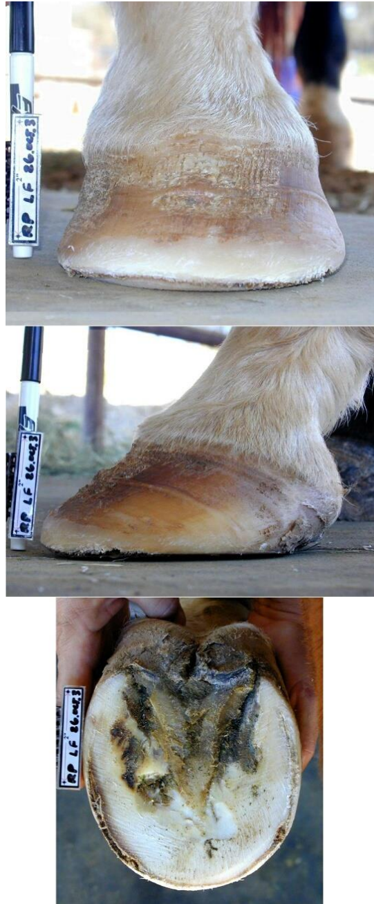
Figure 4: RP's left fore in 2003.

RP was healthy and strong enough to be in a pasture but I was not comfortable with putting her with my young warmblood mares. I let RP have her own pasture. This did not work, RP hated being alone and made it very clear by pawing very large holes by her