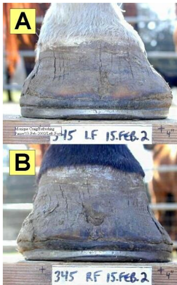
Figure 1. RP in February of 2002.

I was called to help this mare as a last resort. RP was a week away from being put down when I started to get involved with her case. I started to work on RP in February of 2002. The radiographs did not look good but it was nothing compared to the state of her hooves. RP's entire hoof capsules were practically dead. Large pieces of wall came off in my hands as I touched the hooves! The situation looked even worse when I looked at her soles. They were thin, weak and very 'dropped'. At one point I started to wonder what I had gotten myself into! I heard that a couple other farriers had declined to work on this case. I managed somehow to glue composite shoes on her hooves. I was not very optimistic about the outcome of my shoeing. When I started to work on this mare she could barely stand.